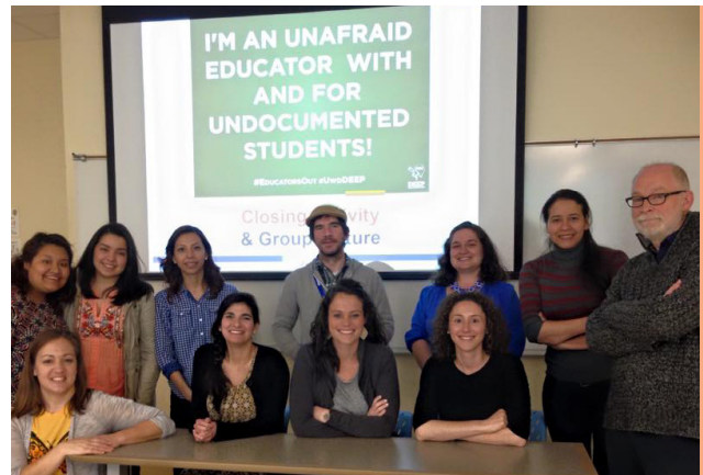
UndocuPeers training at Bluegrass Community & Technical College. Facilitated by the Kentucky Dream Coalition.

Developed by undocumented students, UndocuPeers provides the necessary tools to begin or continue conversations on how to better support and work alongside undocumented students. This program is centered on professional development and provides a space to streamline departmental resources across educational institutions.